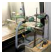
KI DISCUSS TEST